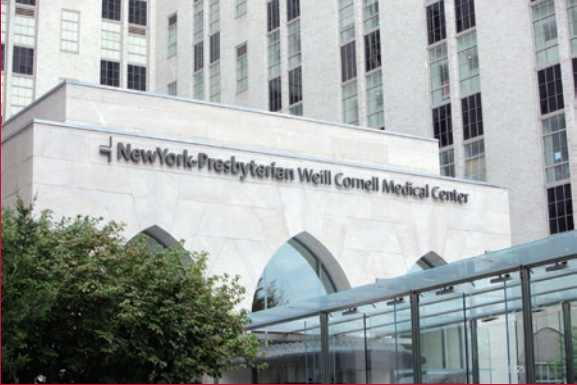
New York-Presbyterian/Weill Cornell Medical Center • New York, New York