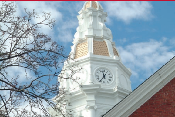
New York-Presbyterian/Westchester Division • White Plains, New York

New York-Presbyterian Psychiatry combines the academic faculty of Weill Cornell Medicine with the world-class facilities of New York-Presbyterian Hospital to advance diagnostic precision and treatment for individuals of all ages. With expertise across all psychiatric disorders, we offer inpatient and outpatient services at three New York City campuses and our historic 214-acre Westchester Division.